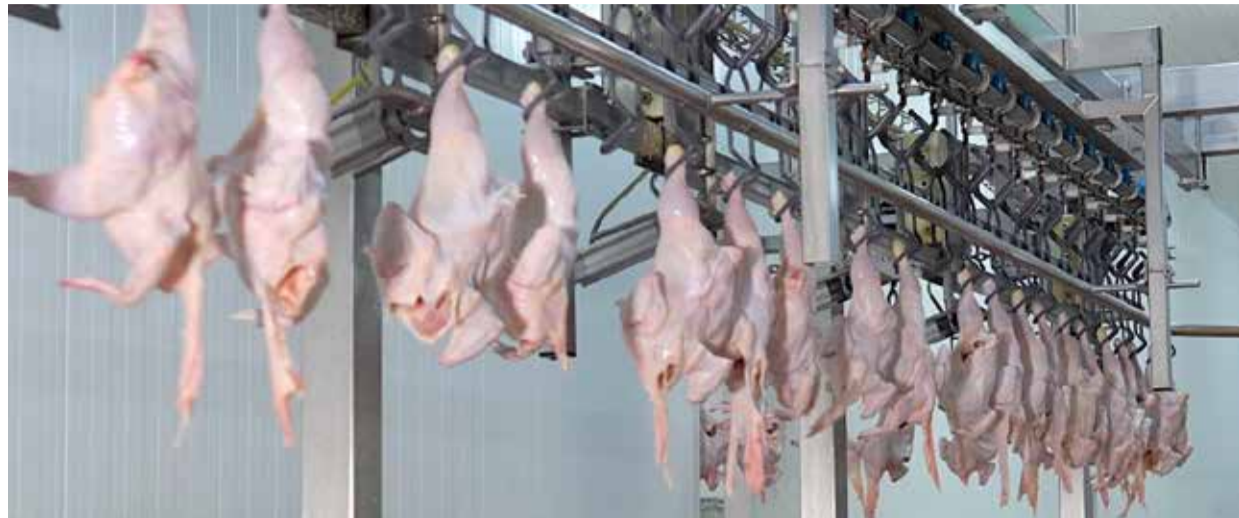
Above-Chicken in the processing stage at The Kenchic Plant in Thika.

Thus, Kenchic maintains an in-house ISO-certified laboratory that tests chicks and chicken products for pathogens and antibiotic residues. The company also follows a strict antimicrobial usage policy where antibiotics are only used under veterinary prescription and never for